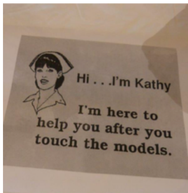
Dark humor on display at the SMSC Expo