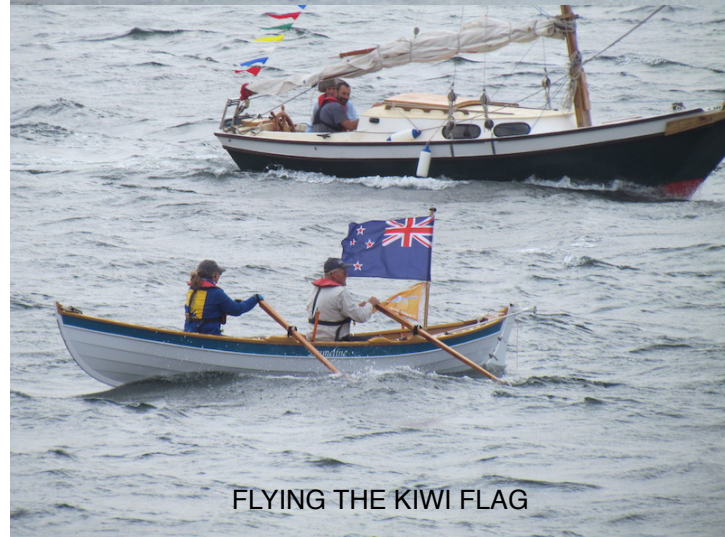
FLYING THE KIWI FLAG