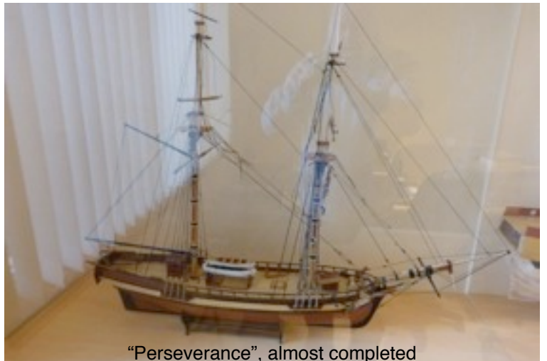
"Perseverance", almost completed