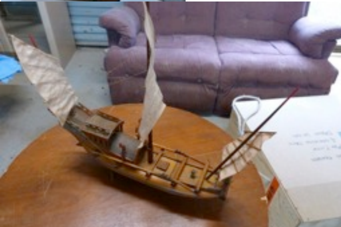
The before and after photos show what can be done without too much effort.

The birthday is in September and with current restrictions in movement I'm not sure it will be collected in time. Unfortunate perhaps, but it will happen at some stage.