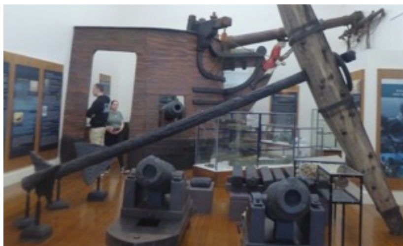
Left - Inside the museum. Below - Models of HMS Sirius and the Sloop Norfolk.

‘well known for other boat building expertise’