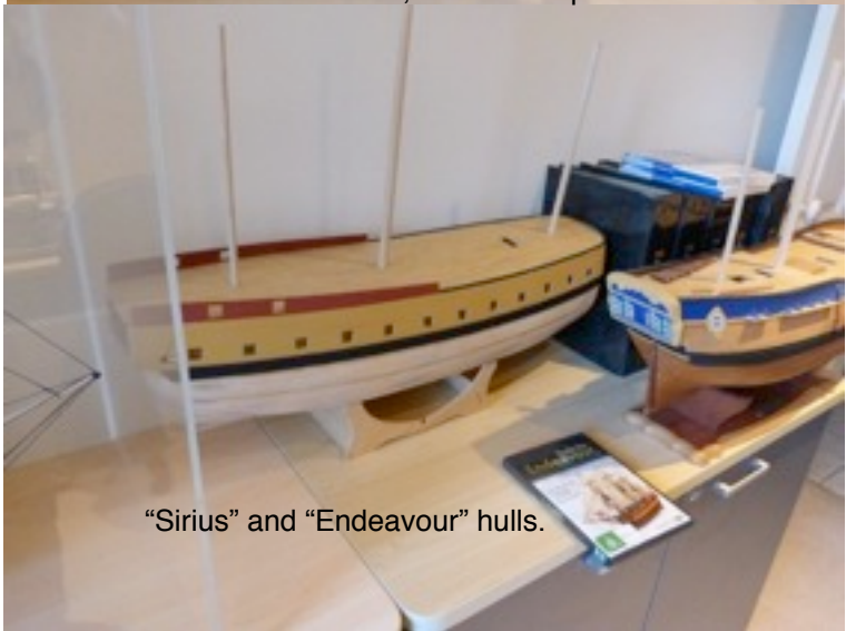
"Sirius" and "Endeavour" hulls.

Last, but by no means least, comes a contact from another lady wishing to donate a model, unbuilt, of the "Endeavour" from Artisanía Latina.