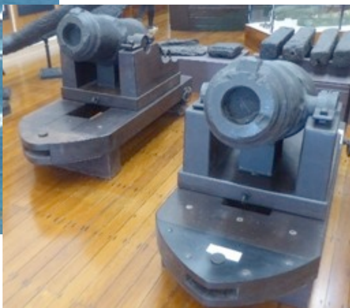
Carronades recovered from the wreck

HMS Sirius Museum located in the one building remaining from the convict prison of the second settlement 1825 to 1855. While there are reasonable artefacts recovered from the Sirius in the museum, I felt that a lot had been removed to other locations within Australia and more should have been done to retain them on the Island. The main focus of the museum, would appear to me to be the tracing of the members of the first fleet for descendants.