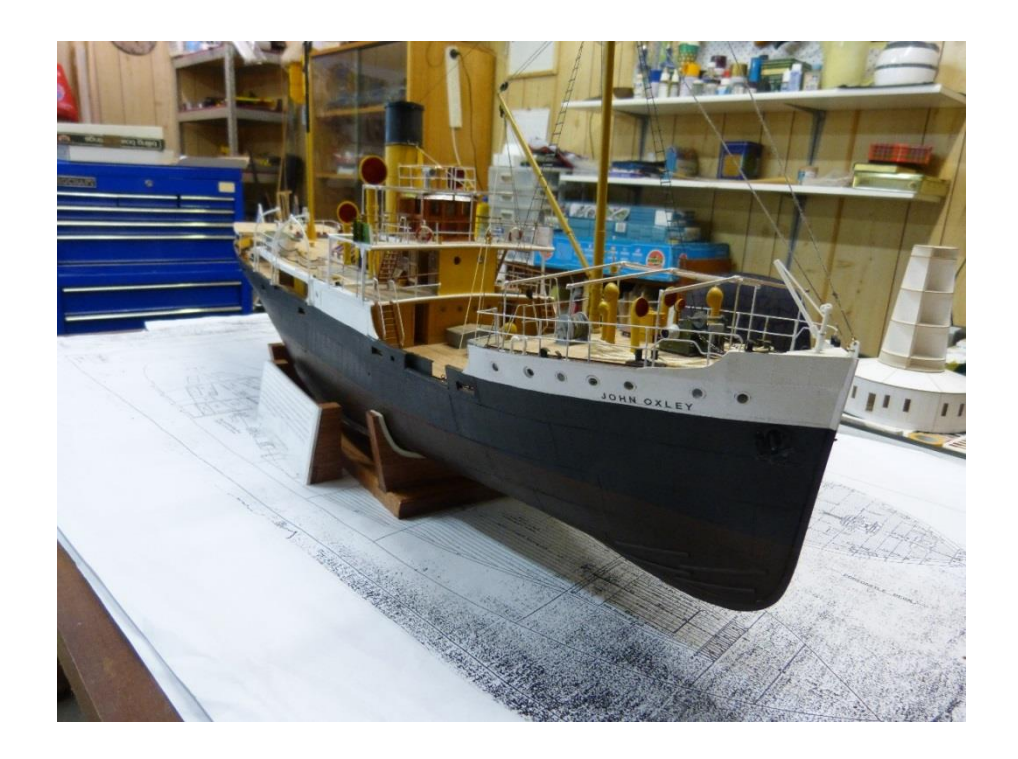
Finally, an overall view. Note the card lighthouse in the background, I think there might be a few members with these items after Expo!