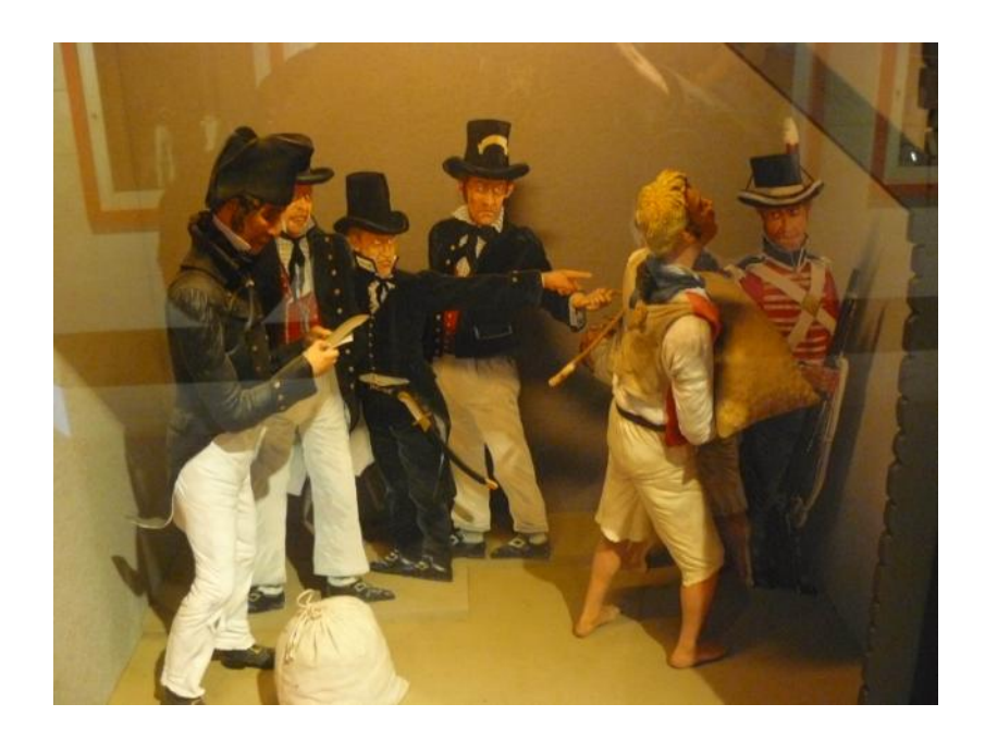
diorama: figures are actually 2 dimension and only 15cm tall