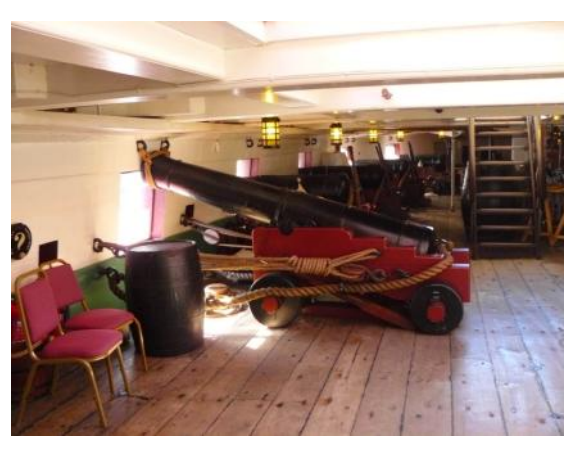
cannons --main deck