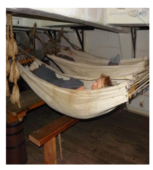
Is he real?