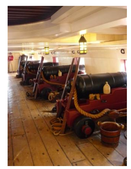
cannons - main deck