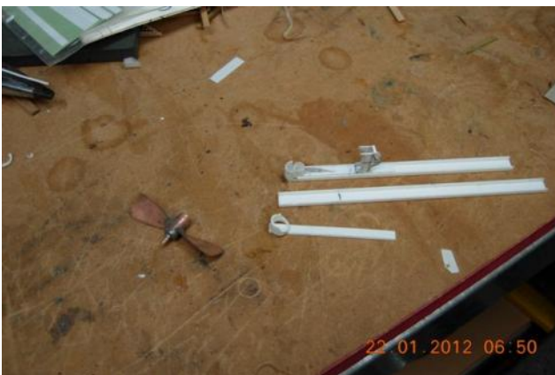
Photo 5: Modified propeller and plastic scratch built channels for the lifting arrangement. This would have been much better completed before the hull was planked.