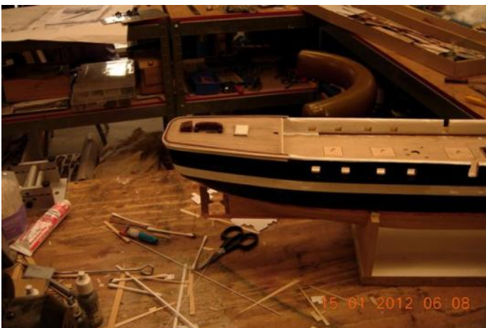
Photo 1: Shows the stern area and hammock rack covers on the main deck. The top of the propeller lifting gear is seen on the poop deck.