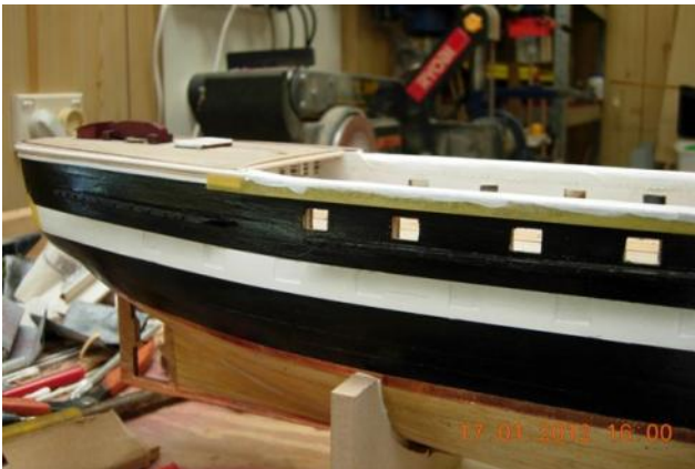
Photo 4: A view of the stern area and the start of the copper plating.