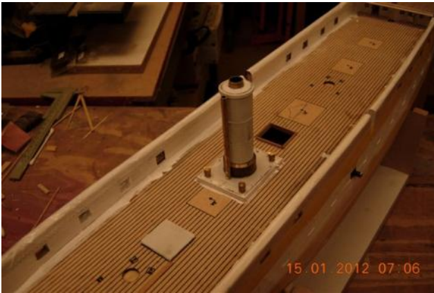
Photo 3: Modified funnel. I have added holding down bolt heads on the casing as these are quite prominent in photos.