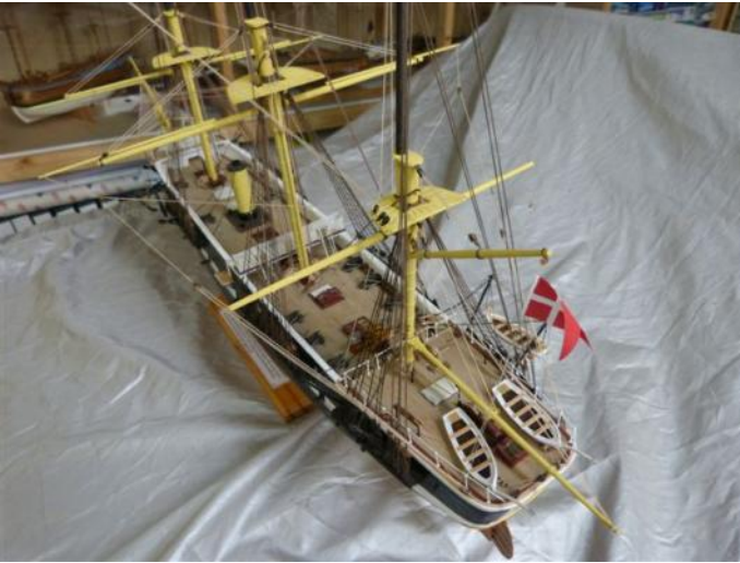
Photo 11: Progress to date. The boats are to be rigged and rigging needs completion.