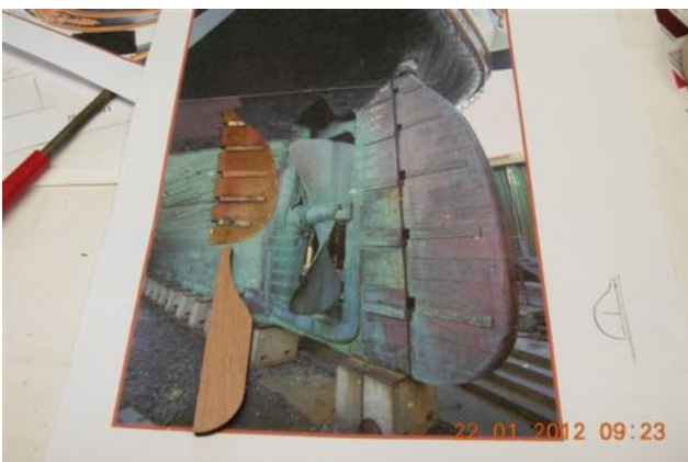
Photo 6: Scratch built replacement rudder and the kit supplied version. The standard of available photos of the real vessel is excellent.