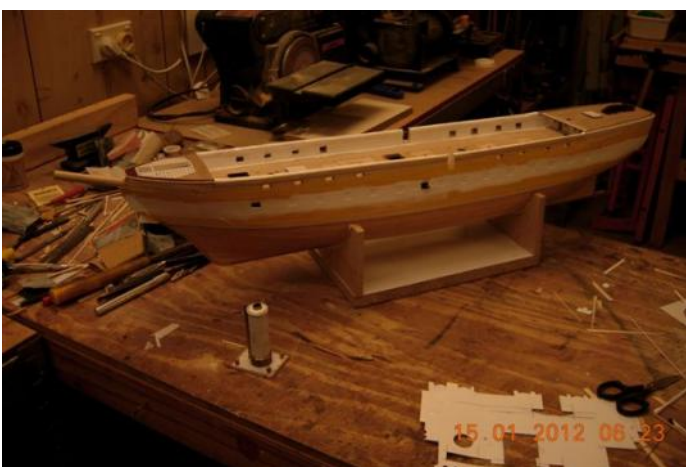
Photo 2: Completed hull planking. Replacement gratings on the foc's'le can be seen as can the bulkhead under the poop deck. The two openings in the hull are where I have installed sub decks for the galley (forward) and the other is below an open hatch.