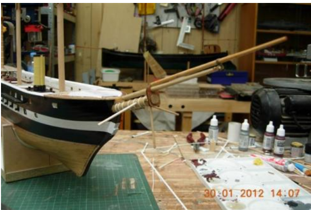
Photo 8: The bow sprit. Modified to be more like the actual than the kit version.