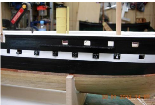
Photo 9: Lower gun ports being fitted. This is how they appear in photos. The spares box provided cannons, the kit does not run to this. Historical accuracy is not guaranteed!