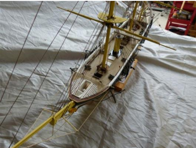
Photo 12: Seen from forward. The opened up foc's'le can be seen in this shot.