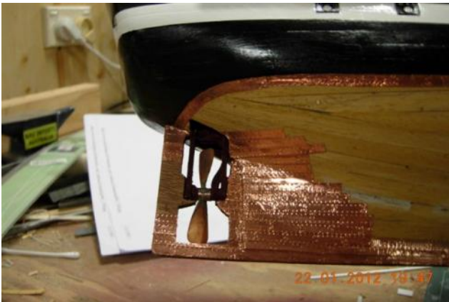
Photo 7: Propellor and lifting channels installed. Extensive work was required in this area, made more difficult by my lack of planning.